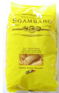
Sgambaro Durum Wheat Mille Righe