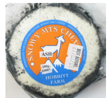
Hobbit Farm Goats Cheese