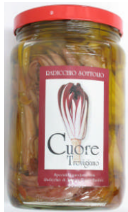
Radicchio from Treviso in Olive Oil 2kg / 300g