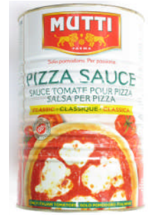
Mutti Pizza Sauce