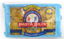
Sgambaro Egg Pasta 250g