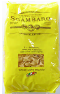
Sgambaro Durum Wheat Reginette 500g