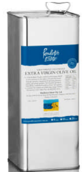
Pendleton Estate Robust & Medium 4L.