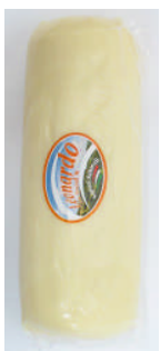
Provalone Dolce Leonardo